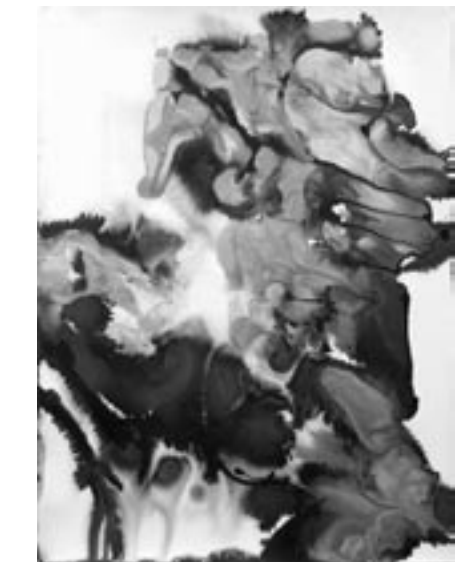
Enthalpy and Entropy: Biomorphological Transformations is the opening exhibit at the Burrison Gallery featuring work by Ruslan Kahis. Above is an untitled acrylic on paper by Kahis.