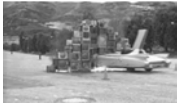
Media Burn by Ant Farm, July 4, 1975. Performance at the Cow Palace, San Francisco, CA.