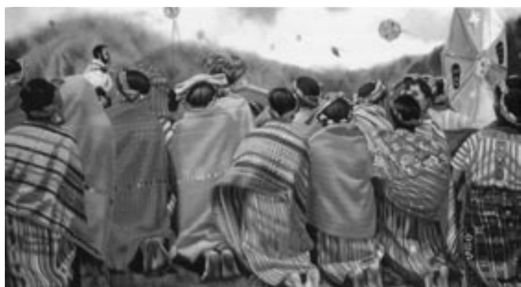
Mayan Procession , an exhibit whose subject is on contemporary Maya people of Guatemala, is on display again at the Penn Museum. The exhibit features 14 large scale contemporary oil paintings by artist Winifred Godfrey and 32 color photographs of the Maya people taken by the artists between 1992 and 2003, as well as traditional, hand-woven Maya clothing and textiles from. The painting above is Zunil Cemetery , oil on canvas, 52" x 96". Mayan Procession runs through September 26 . See Exhibits.

See Exhibits on the other side to find specifics about all the exhibits around campus including those currently on display and those soon to be on view. More images are available on our web site at www.upenn.edu/almanac .