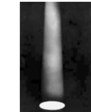
Límite de una Proyección by David Lamelas, 1967. Installation view, Instituto Torcuato Di Tella, Buenos Aires.

and media installations of Argentinean artist David Lamelas; ICA; reception: September 10, 6 p.m. Through December 12. Ramp Project : Amy Sillman; a large wall-work by artist Amy Sillman whose paintings are figurative, decorative, narrative and abstract; ICA; reception: September 10, 6 p.m. Through December 12. Ant Farm: 1968-1978 ; surveys the work of the architecture and art collective, Ant Farm, a group of radical architects who where also video, performance and installation artists; ICA; reception: September 10, 6 p.m. Through December 12. See Talks.