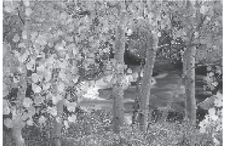
On display at the Burrison Gallery in the Inn at Penn is landscape photography by Morris Swartz in the exhibit Earth Tones . The exhibit will run through October 15. See Exhibits.

Whenever there is more than meets the eye, see our website, www.upenn.edu/almanac/ .