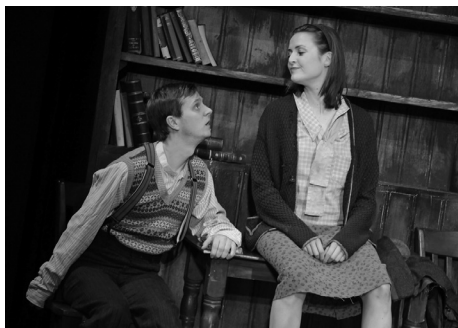
Above: The Cripple of Inishmaan will play the Zellerbach Theatre, Annenberg Center, from May 19-22. The dark comedy set in 1934 rural Ireland is part of the Annenberg Center's Irish Roots Series. Visit www.annenbergcenter.org for information and tickets.

There will be no issue May 17 due to Commencement. The final issue of the semester comes out May 24 and includes the Summer AT Penn calendar as well as Commencement coverage. The schedule for the remainder of the academic year is online at www.upenn.edu/almanac/issues/vol57.html . Submissions are due every Tuesday for the following Tuesday's issue.