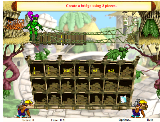
Figure 4. Bridge Builder.