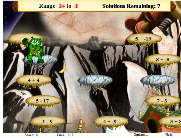
Figure 2. Crater Crossing.